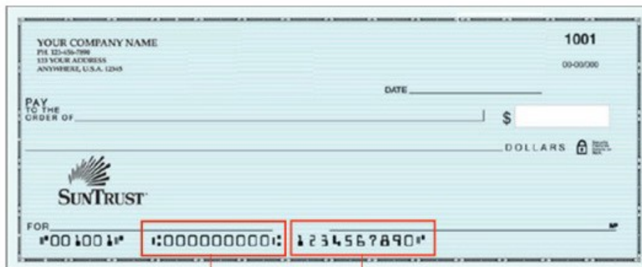
Routing Number Account Number

The routing and account numbers are located on the bottom of your check. The routing number is always a 9 digit number and appears to the left of your account number. DO NOT look for these numbers on a deposit slip, as the routing number may be different from your checking/savings routing number. If you are unable to find your routing and account numbers, please contact your bank for help.