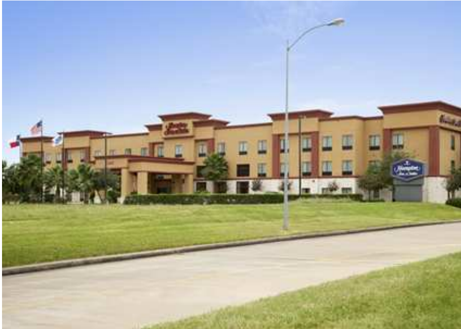
Available parking front and rear of hotel