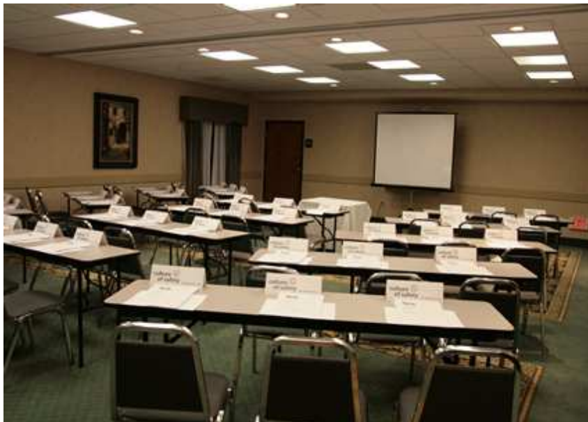
Meeting room adjacent to lobby and front desk