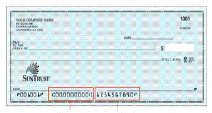
Routing Number Account Number